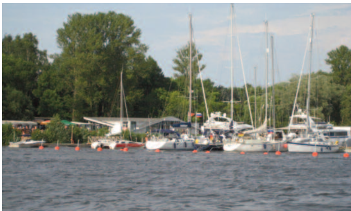
Krestovskiy Yacht Club marina V Ivankiv

In theory foreign yachts may berth at any of the St Petersburg marinas, but of these only Central River Yacht Club and Krestovski Yacht Club are suitably located.