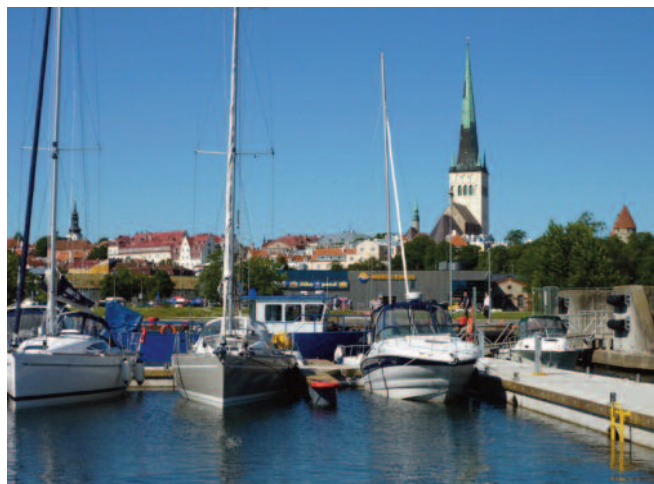
Old City Marina looking towards Old Tallinn G & F Cattell

Add to first paragraph: A washing machine (no dryer) is available at the TOP Marina but is inconveniently sited on an upper floor some distance along a corridor.