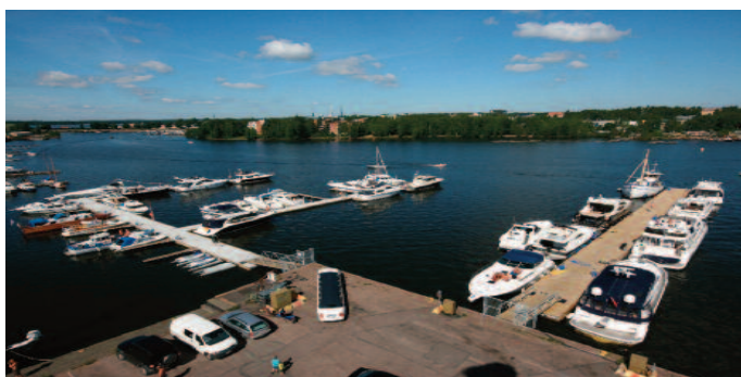
View N towards the city, over New Port Kotka marina

Details from www.kotkayachtstore.fi or ☎ +358 (0)5 225 0074.